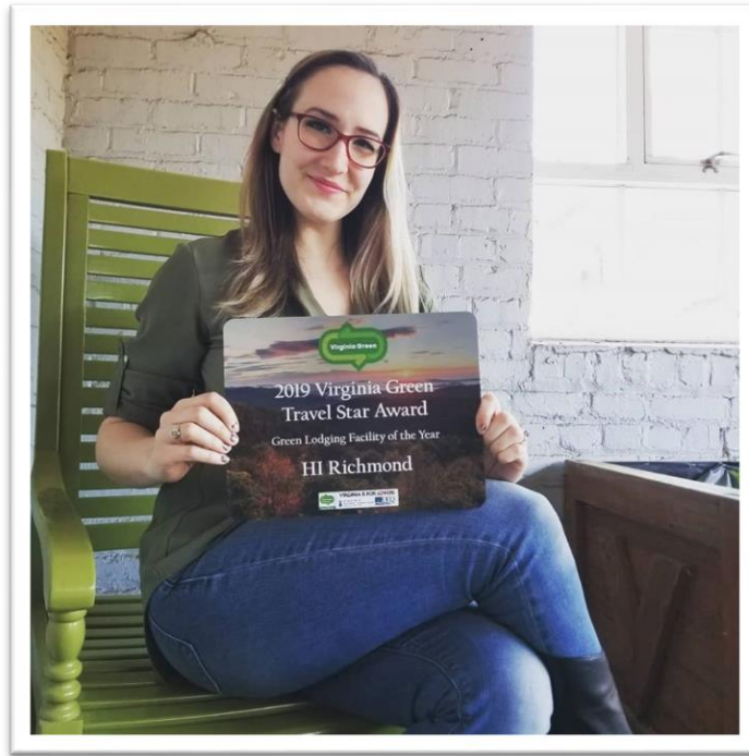
HI Richmond was awarded the 2019 Virginia Green Travel Star Award for Green Lodging Facility of the Year

HI Richmond's commitment to sustainability improves its environmental, social and financial bottom lines both nationally and locally at the hostel. Effective green building design of the hostel, including efficient equipment, has resulted in reduced water and energy consumption compared to similar accommodations. HI Richmond uses 70% of the energy and 25% of the water per square foot versus the average Richmond hotel. Because of the efficiency built into the facility, HI Richmond saves approximately $6,700 on energy and $17,000 on water per year compared to an average Richmond hotel.