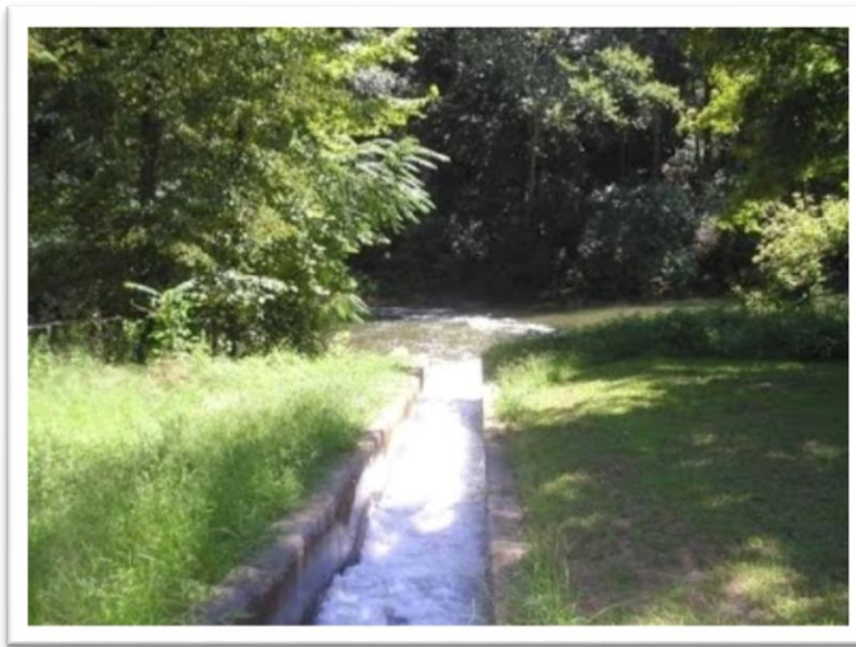
Treated wastewater being discharged into the North River using cascade aeration.