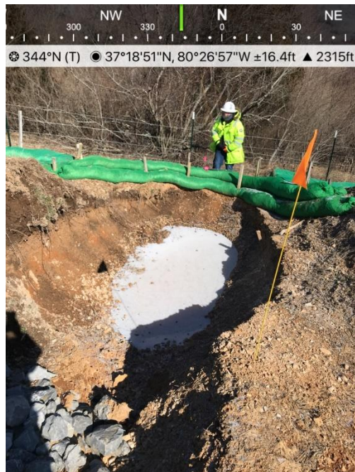
Fig. 3 St#1421+50 sump end treatment is undermined