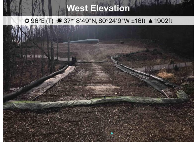
Figure 2: Designated crossing S-RR14, ECD's are in place.