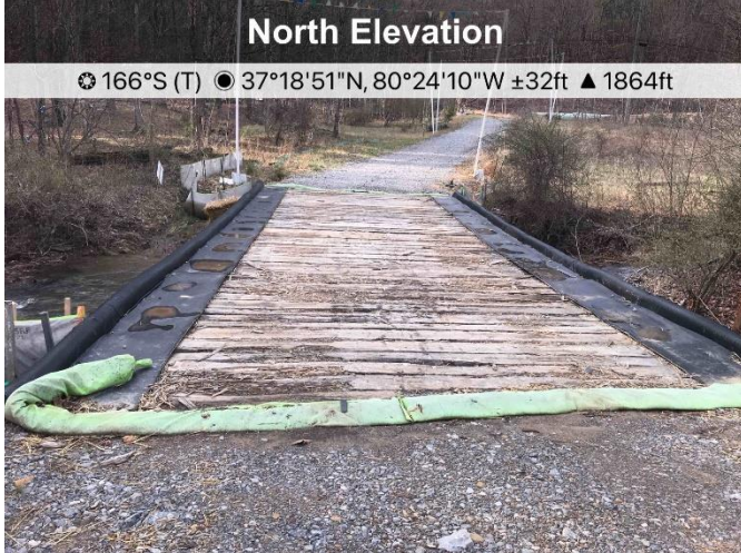
Figure 1: Designated crossing S-RR13, ECD's are in place.