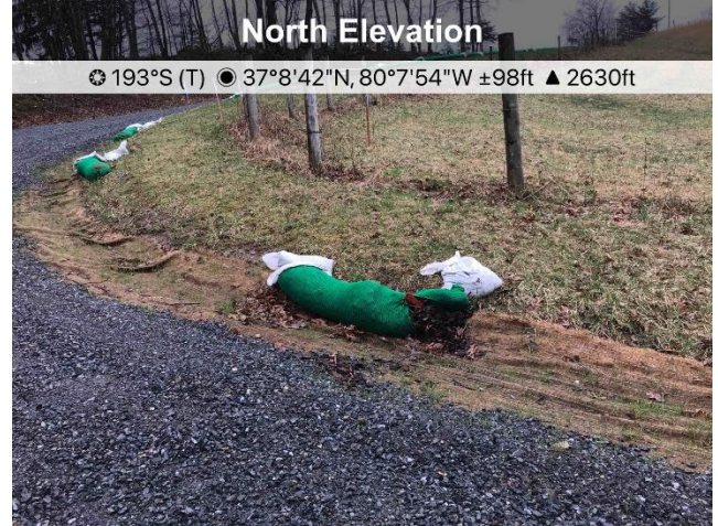
Figure 2: CFS maintenance required along AR RO 286.