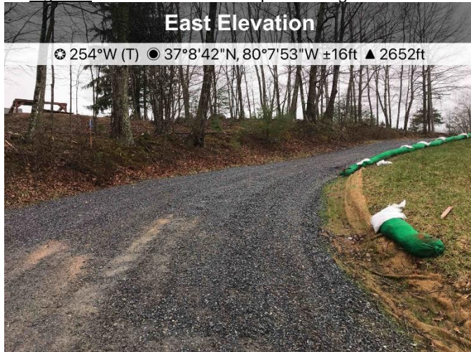
Figure 3: CFS maintenance required along AR RO 286.