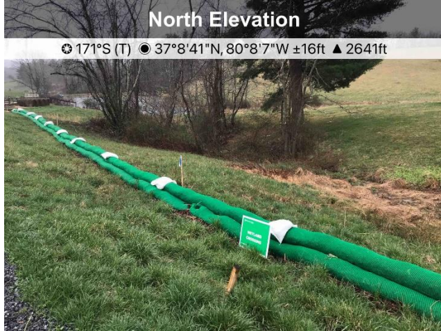
Figure 1: Protected wetland W-CD9 remains undisturbed.