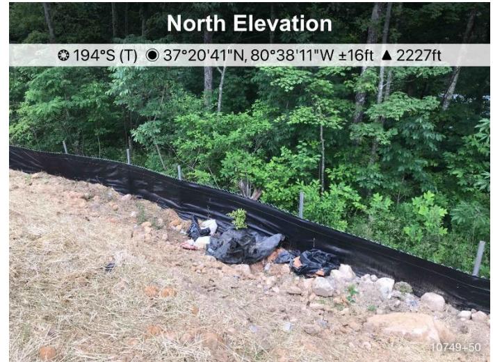
Figure 2: Uncontained trash at St10749+50