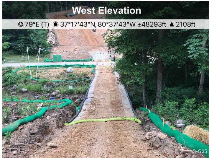
Figure 1: Designated crossing S-G35 ECD's are in place.