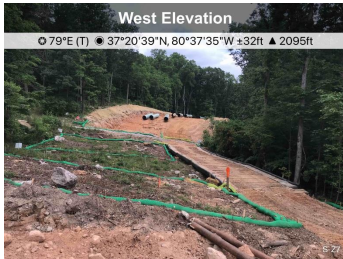
Figure 3: Designated crossing S-Z7, ECD's are in place.