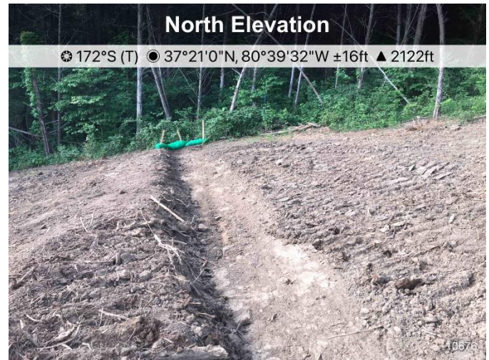
Figure 2: Installation of temporary waterbar at St10676.