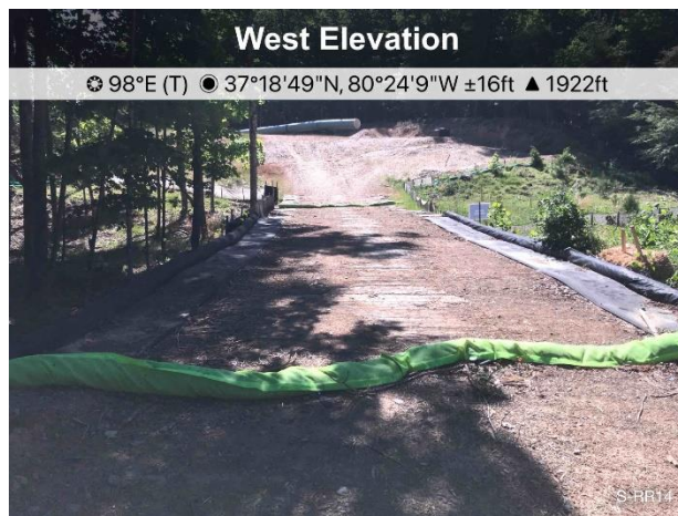
Figure 3: Designated crossing S-RR13, ECD's are in place.