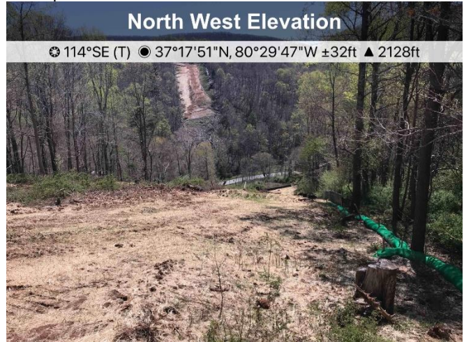
Figure 2: Near St11246+83, area has been stabilized and ECD's are in place.