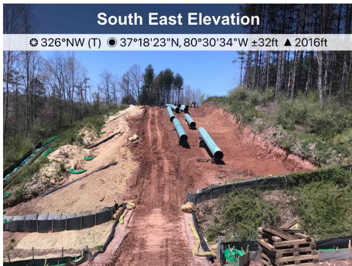
Figure 3: Near St11190, pipe has been strung and ECD's are in place for active construction.