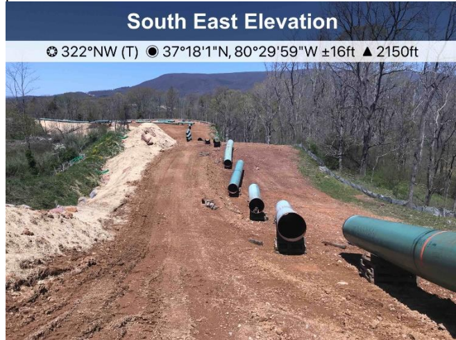
Figure 1: Near St11233, pipe has been strung and ECD's are in place.