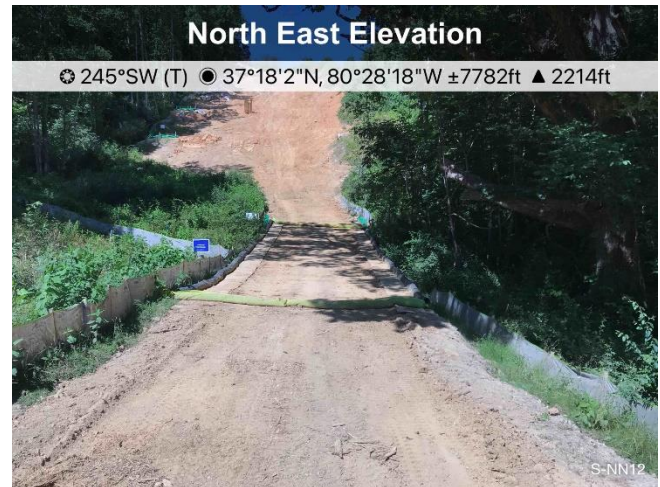
Figure 2: Designated crossing S-NN11