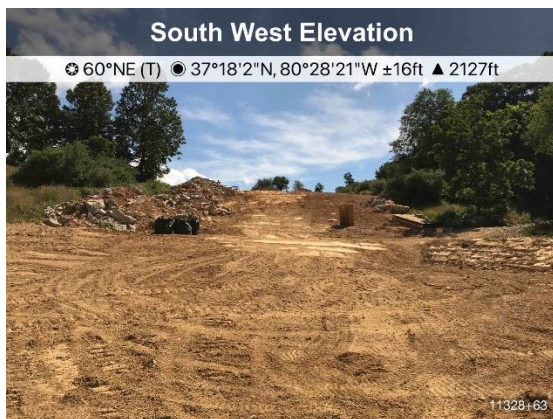
Figure 3: St 11328+63 ECD's are in place.