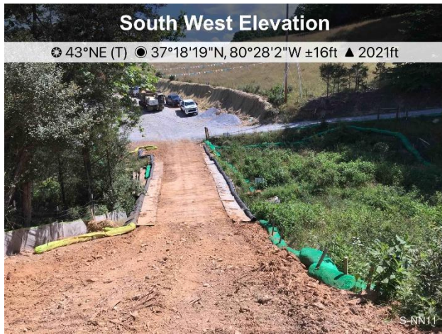
Figure 1: Designated crossing S-NN11